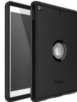
Black 77-62035 660543503477